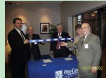
Grand Opening Ribbon Cutting Ceremony