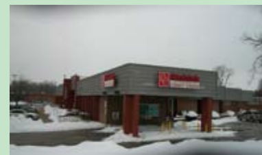
Akron's new location at 1900 West Market St.